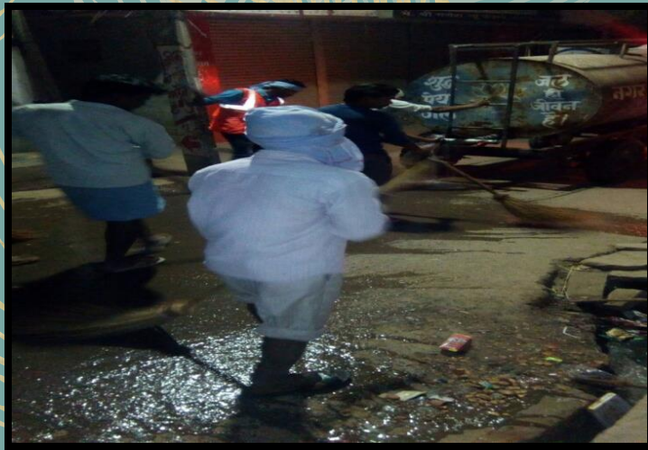
Drain cleaning on daily basis